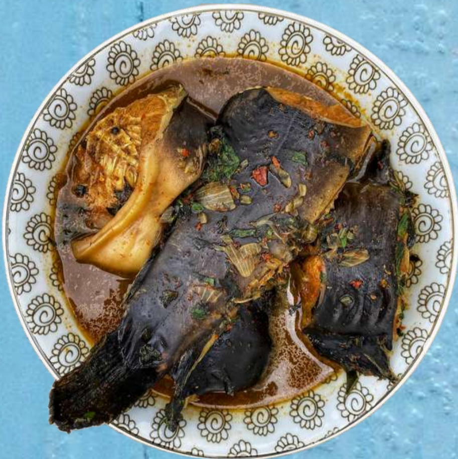
CATFISH PEPPER SOUP N17,640 Traditional Nigerian catfish pepper soup served with your choice of plantain, yam or white rice