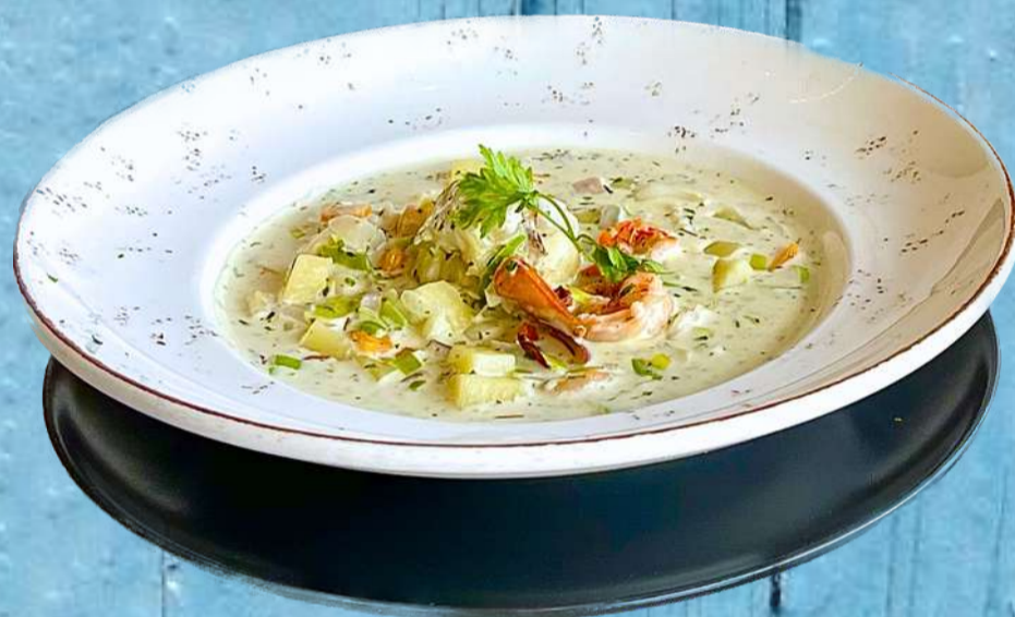
SEAFOOD CHOWDER N12,600 Creamy seafood chowder soup including prawns, shrimps, lobster, calamari, potato, carrot, leek, onion, garlic, and parsley