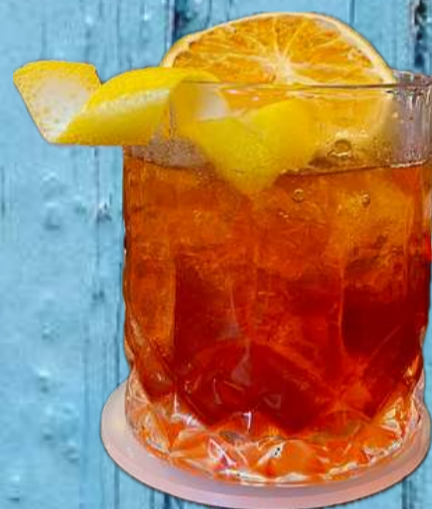
OLD FASHION N14,640

Rye whisky or bourbon, simple syrup, angostura bittles