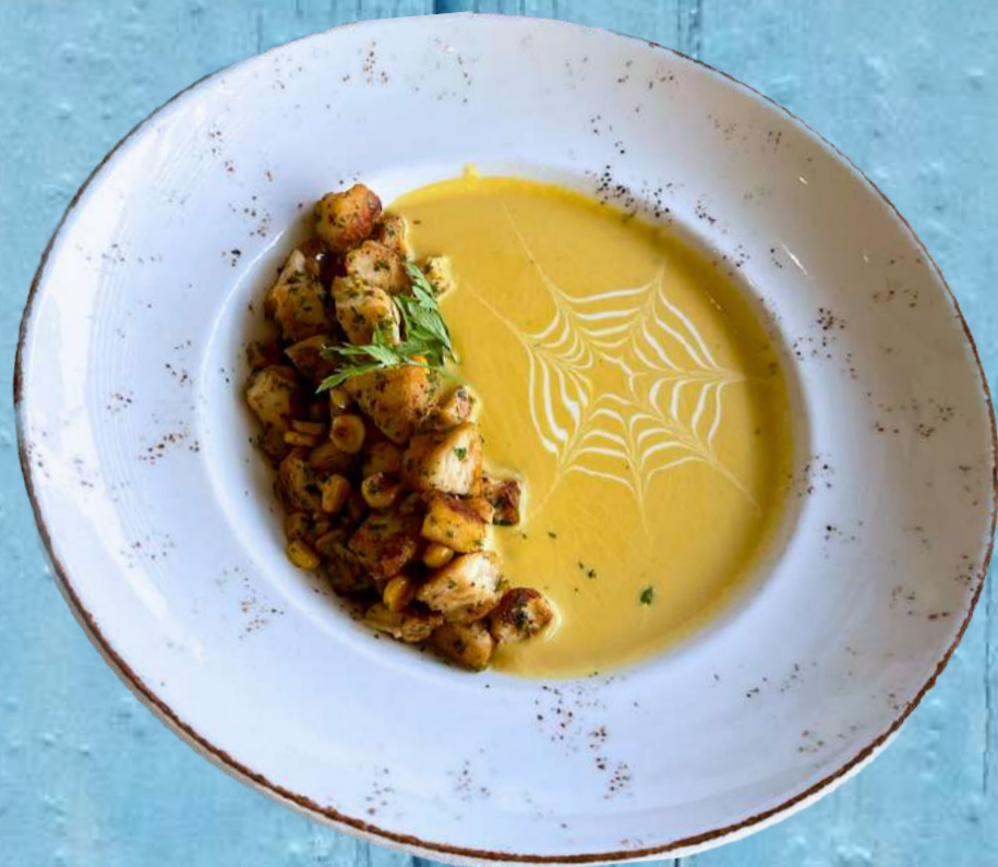
CHICKEN CORN SOUP N12,600 Thick creamy chicken corn soup