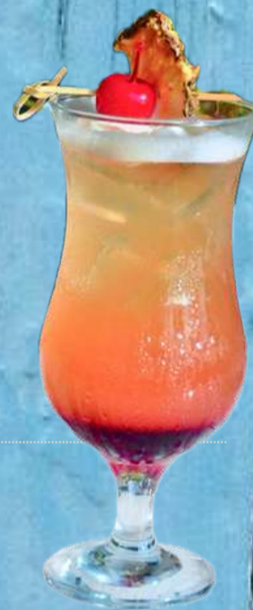
MAI TAI N14,640

Rye whisky or bourbon, simple syrup, angostura bittles