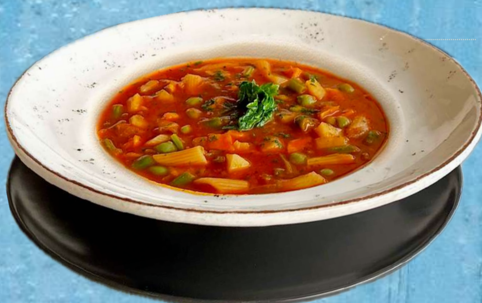
MINISTRONE SOUP N12,600 An Italian-style soup including tomato, potato, peas, onion, celery, green beans and penne pasta