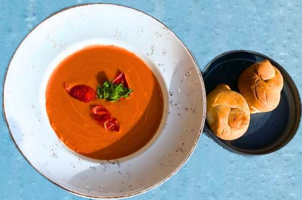
CREAMY TOMATO SOUP N12,600 A creamy blend of tomato, onion, garlic and parsley