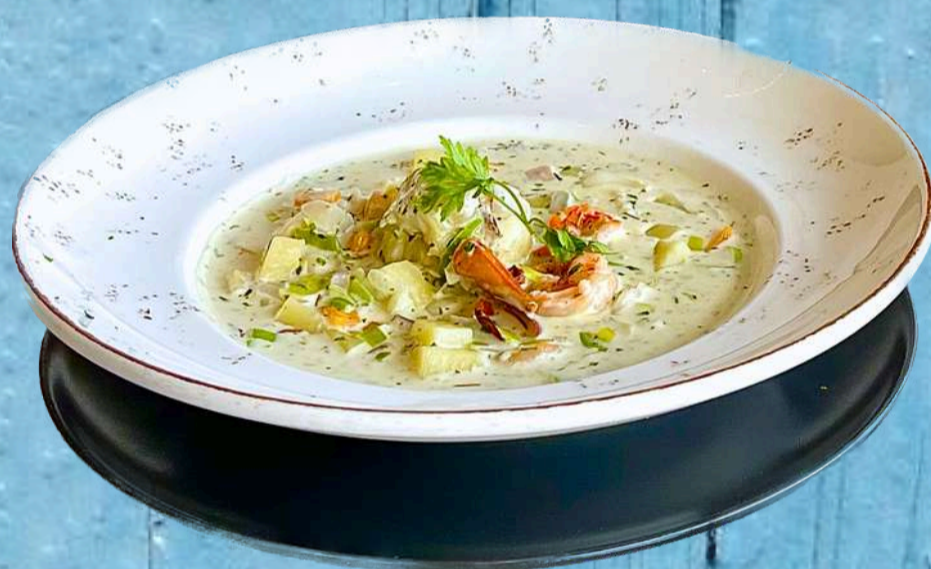
SEAFOOD CHOWDER N12,600 Creamy seafood chowder soup including prawns, shrimps, calamari, potato, carrot, leek, onion, garlic, and parsley